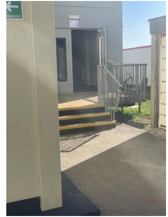
The Ark surrounded by scaffolding. There are signs and staff to show you where your class is!