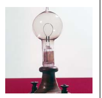
Top tip: http://www.primaryhomeworkhelp.co.uk/victorians/inventiotimeline.html - This website is a great starting point!

As an eco-school, we are keen to save paper wherever possible therefore your homework will be uploaded onto the school website each week. However if you require a printed copy, please let your teacher know.