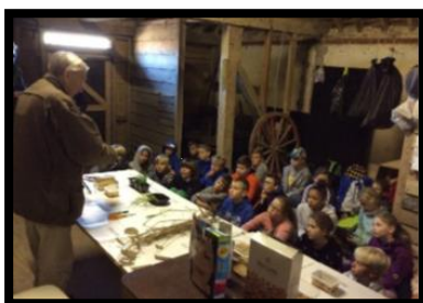
Above: A great place to learn! Right: The Y4 Play in full swing.

Applesham Farm is a fun, educational trip for the Year Five Pupils. They spend a day at the farm learning about the nature, crops and animals. In year five you get to go three times, once each term, so you can see the changes. Lots of people enjoy the third trip most of all, where they get to see the baby lambs. You even get to hold them, which is a lot of fun!