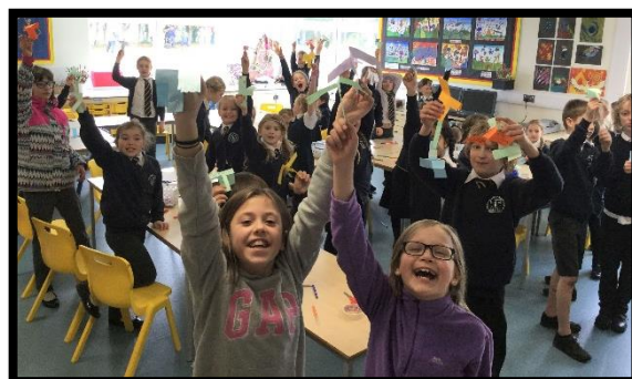
Above: KS2 children proudly presenting their helicopters for testing.

Finally, in Advanced Coding Club, the children have been coding their own apps and have even programmed a little robot! One coder said that the club was "A great way to get into secondary school coding!"