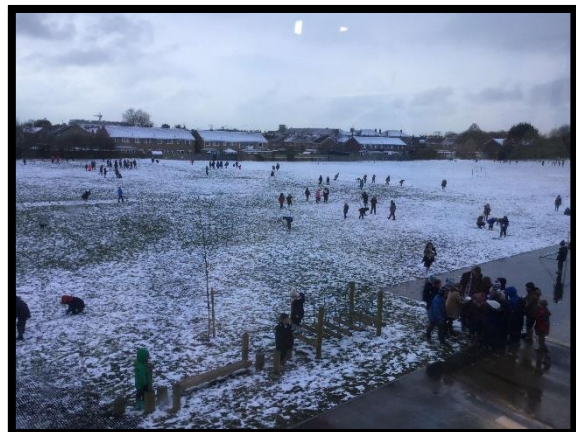
Above and Above Right: Snow on the field. Everyone had a great time - even the teachers!