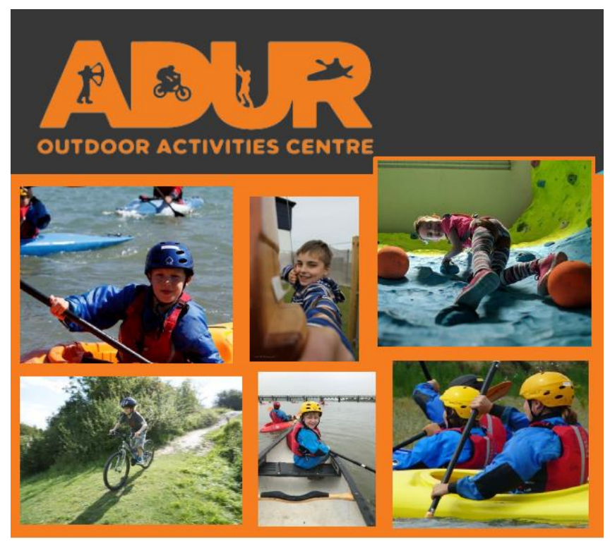
Ages 8 - 13