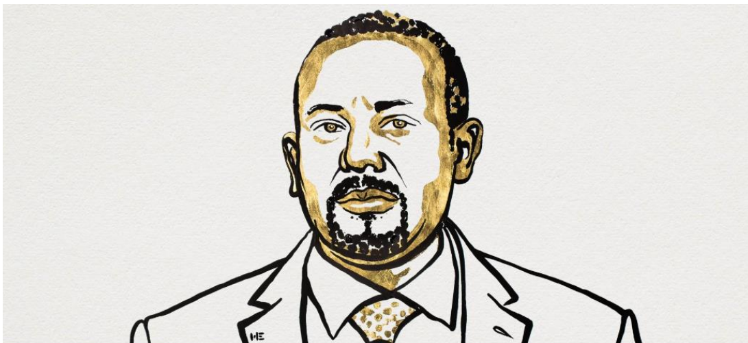
III. Niklas Elmehed. © Nobel Media.

The resource is available for download from our website here .