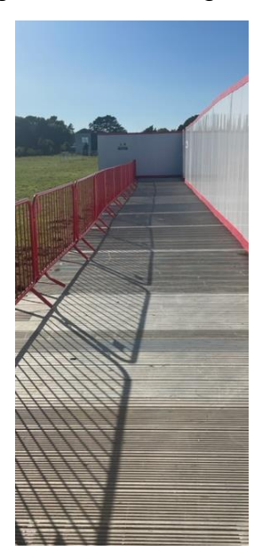
Path around the field.