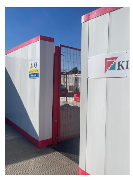
'Fir Tree Playground Gates'