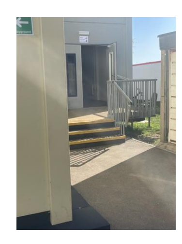
The Ark surrounded by scaffolding. There are signs and staff to show you where your class is!