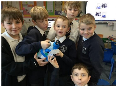
Y4 made torches in science to explore inside a pyramid.