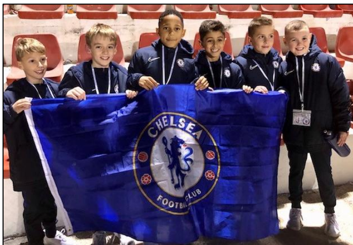
U11 football team