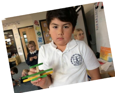
Y2 Puffins made wooden airplane toys in Science in materials topic.