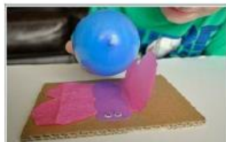
STATIC ELECTRICITY Butterfly Experiment ... watch the wings move!

The Childcare Club at Buckingham Park Primary School, Buckingham Road, Shoreham, BN43 5UD Email: theccworthing@gmail.com Tel: 07551 062186 www.thechildcareclubworthing.co.uk The entrance to the club is through the green gates to the right of the car park