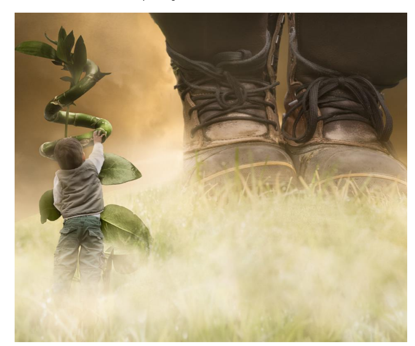
Top of the Beanstalk